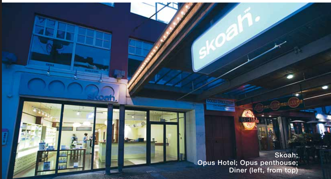
Skoah; Opus Hotel; Opus penthouse; Diner (left, from top)