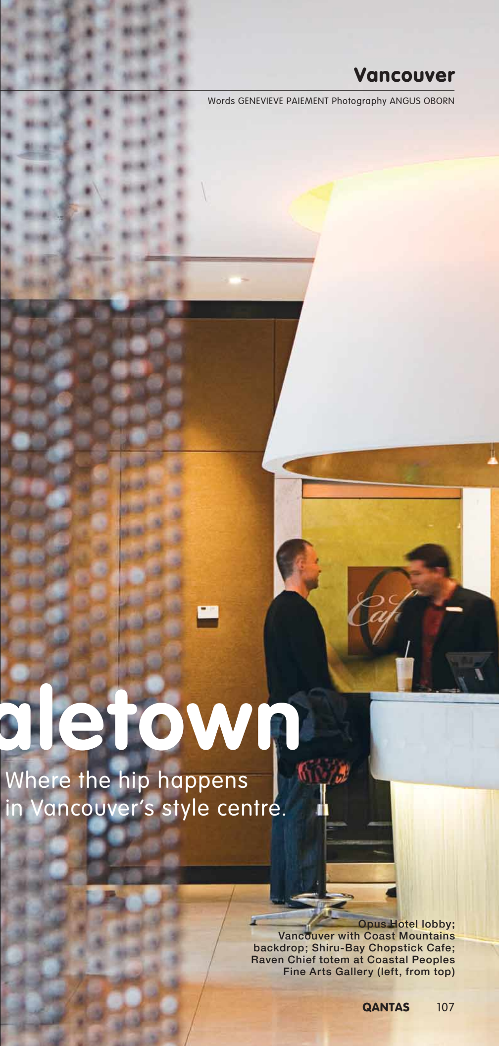
Opus Hotel lobby; Vancouver with Coast Mountains backdrop; Shiru-Bay Chopstick Cafe; Raven Chief totem at Coastal Peoples Fine Arts Gallery (left, from top)

Where the hip happens in Vancouver's style centre.